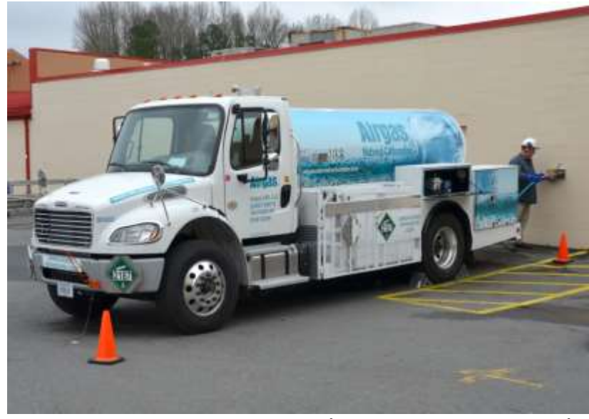
CO<sub>2</sub> Route Driver Filling Location (3 ½ Ton CO<sub>2</sub> Delivery Truck)

The Delivery is determined by the volume of each individual location & scheduled accordingly; typically this delivery cycle is every 21-30 days.