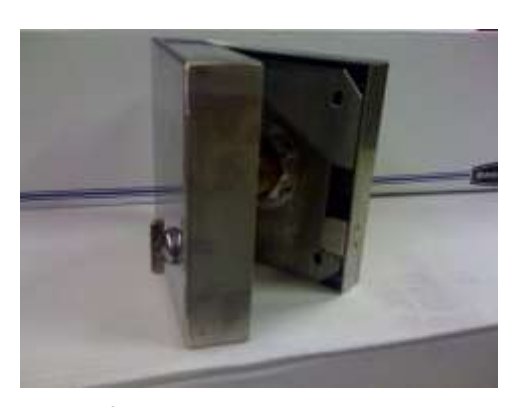
Surface Mount Fill Box