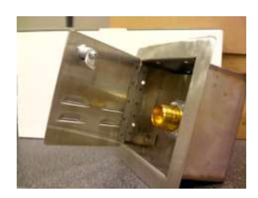
Flush Mounted Fill Box